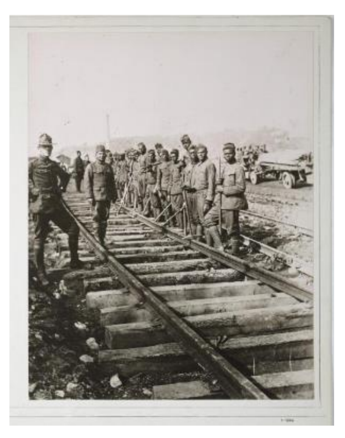
African American Soldiers Building a Railroad in France in World War I (National Archives)