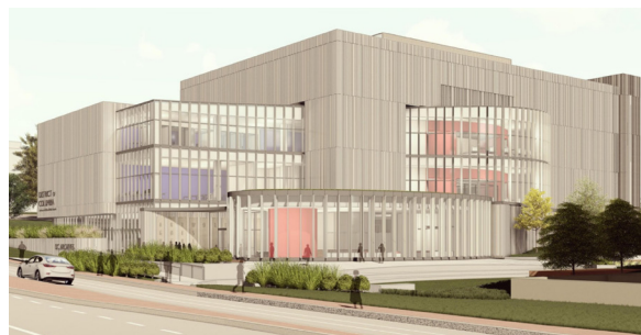
Above: Conceptual rendering of the new home of the DC Archives on the UDC Van Ness campus (Hartman Cox Architects)