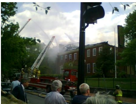
DC Fire Department Pours Water on the April 20, 2007 Fire That Consumed the Georgetown Branch Library

As the AOI continues its quest to ensure the health of the District's historic records (DC Archives, Recorder of Deeds, Kiplinger Library, Sumner Museum & Archives and the Washingtoniana Collection), we encourage you to follow the developments of the restoration of the Georgetown Branch Library and to contribute generously to help meet the fund-raising goal to receive the matching grant.