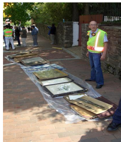
A DC police detective 'stands guard' over salvaged artifacts in the aftermath of the April 20, 2007 fire