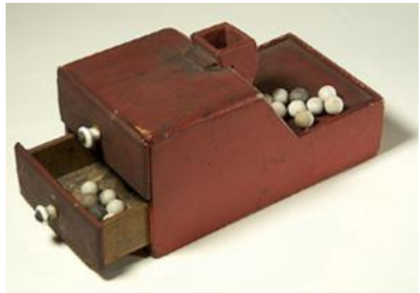
An early ballot box, using colored marbles, was part of AOI's extensive collection of 'curiosities.' It is at the Smithsonian.