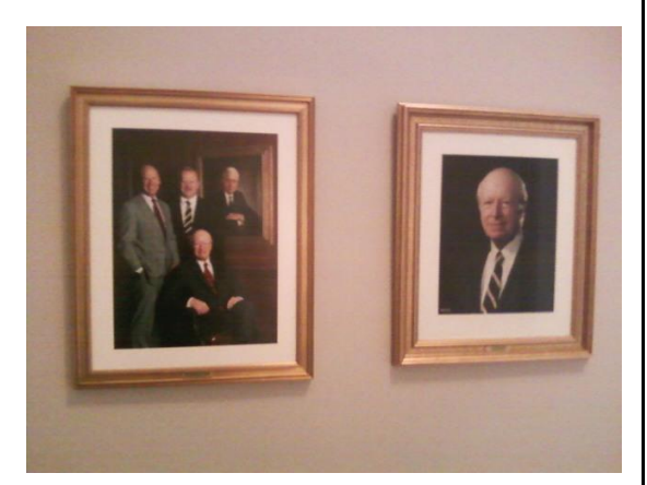
Family portraits at the Kiplinger Research Library entrance.