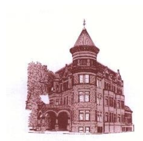
The Heurich House Museum is the former home of the Historical Society of Washington and served as AOI's headquarters from 1956 until 2003.