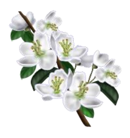
Please join us...

Friday, March 19th, at the Channel Inn (free Parking) 650 Water Street, SW. (Maine Avenue via Metro Rail Green to Waterfront Station/SEU, Metro Bus 70 or Downtown Circulator Bus), Social Time (cash bar) 11:45 a.m., Luncheon served at 12:30 p.m. ($21 per person - please have checks <u>completed prior to arrival</u> and