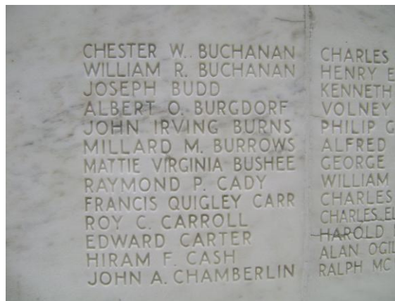
A sampling of the 499 names engraved around the base of the DC War Memorial. The listing of the fallen is significant because names are listed alphabetically without regard to rank, sex or race.

"The names of the men and women from the District of Columbia who gave their lives in the World War are here inscribed as a perpetual record of their patriotic service to their country. Those who fell and those who survived have given to this and to future generations an example of high idealism, courageous sacrifice and gallant achievement."