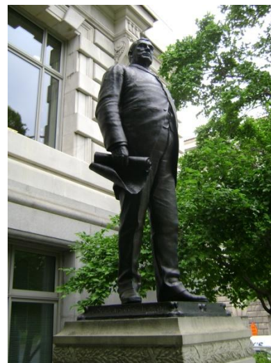
The Governor Shepherd Statue has been beautifully restored by Artex Fine Art Services (Landover, MD) with a grant from the District's Commission on the Arts & Humanities. Please visit the refurbished statue and read AOI's biographical plaque. It is located on the southeast corner of 14 th Street & Pennsylvania Avenue.