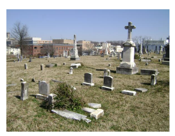
Holy Rood Cemetery, located at Wisconsin Avenue & 35<sup>th</sup> Street, is maintained by Georgetown University and Holy Trinity Church but needs work and TLC.