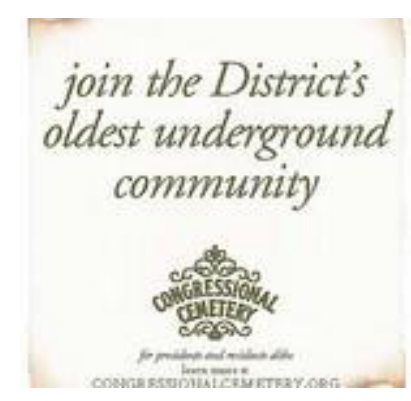
Promotional item from Congressional Cemetery (contemporary).