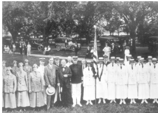
"Women Marines & Yeoman flank Secy. of the Navy Josephus Daniels and Ass't. Secy. of the Navy Franklin Roosevelt and their aides on the occasion of the women's final review on July 30, 1919"

Originally published in the Feb. 1932 issue of 'American Forests.'