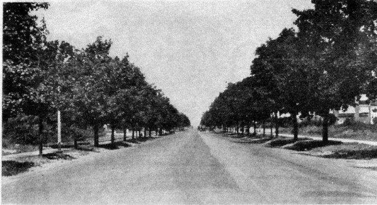
Memorial trees on Sixteenth Street planted in honor of the men of the District of Columbia who gave their lives during the World War.

Originally published in the Feb. 1932 issue of 'American Forests.'