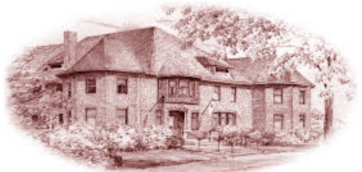
The Whittemore House (1892-94), home of the Women's National Democratic Club, hosts the AOI's monthly luncheon meetings. The National Register property was originally built for Sarah Adams Whittemore, and was purchased by the WNDC in 1927.

TIME TO RENEW! Check your mail for your annual renewal notice, or renew online at www.aoidc.org/members-renewal.html