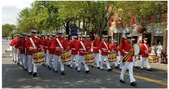
The Capitol Hill Community July 4th Parade famously starts with the USMC Drum & Bugle Corp and wraps up with the traditional cavalcade of DC sanitation trucks – with just about everything else imaginable in between.

Of course, the city's main event this summer will be the celebration of our nation's Semi-Quincentennial , marking the 250 th anniversary of the signing of the Declaration of Independence (on display, BTW, at the National Archives' Charters of Freedom Rotunda, along with a special exhibit, Free and Independent: A Celebration of the Declaration , in the Archives' Lawrence F. O'Brien Gallery). Although this year's celebration is bringing visitors to our city from all over