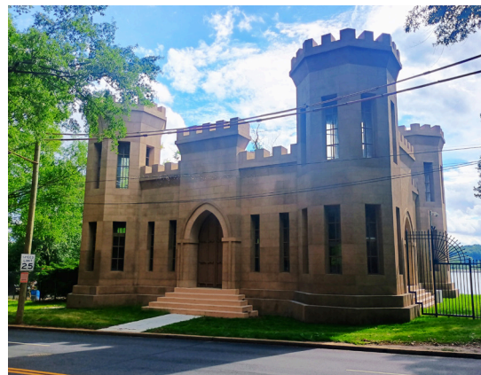
As originally noted in our Spring 2024 Newsletter, AOI was in the forefront of efforts to hold the Army Corp of Engineers' feet to the fire in their restoration of the Washington Aqueduct's Castle Gatehouse. The finished result, looking as good as new, debuted this spring – job well done!