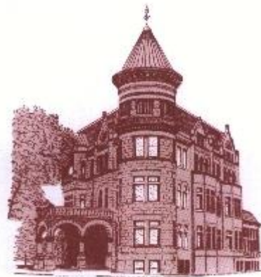
The Heurich House Museum is the former home of the Historical Society of Washington and served as AOI's headquarters from 1956 until 2003.