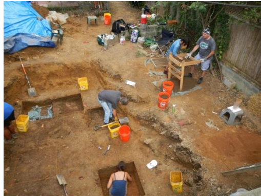
Excavation of Yarrow Mamout site in Georgetown