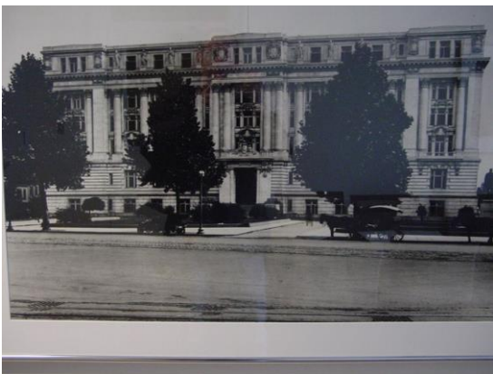
The District Building (John A. Wilson Building) was dedicated on July 4, 1908.