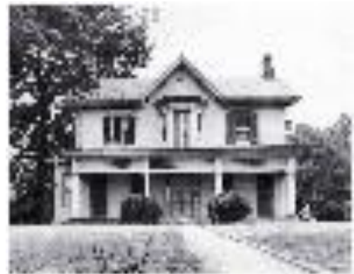
Frederick Douglass' Cedar Hill

premiered in 2017 together with Iowa, Missouri, New Jersey and Indiana. In 2010, the program will launch with, among other sites, The Grand Canyon (AZ), Yellowstone (WY) and Mount Hood National Forest (OR). The last in the series will feature the Tuskegee Airmen National Historic Site in Alabama in 2021.