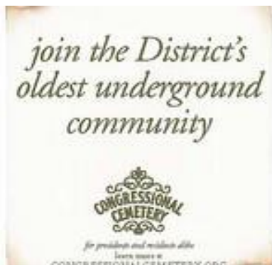
Promotional item from Congressional Cemetery (contemporary).