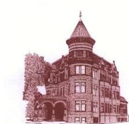
The Heurich House Museum is the former home of the Historical Society of Washington and served as AOI's headquarters from 1956 until 2003.