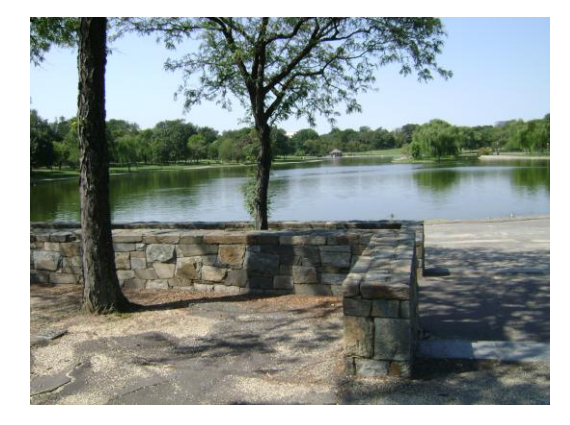
This view of Constitution Gardens suggests a commemorative work to WWI would be 'lost' in its vastness and somewhat 'off the beaten path' to visitors.