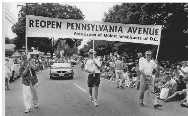
AOI members called for the re-opening of Pennsylvania Avenue in the Palisades 4th of July Parade. (c. 1999).

Our e-mail address is: aoiofdc@gmail.com Our web site is http://www.aoidc.org or simply "Google" 'Governor Shepherd' and we'll pop-up!